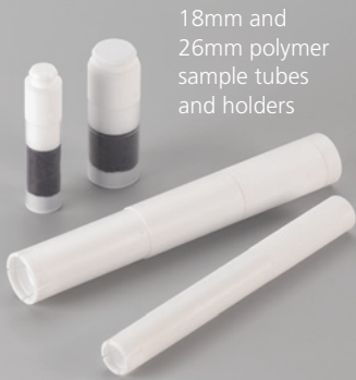
18mm and 26mm polymer sample tubes and holders

Useful for applications where there is large sample to sample variability, and also for textiles and nonwovens (using the polymer sample tubes).