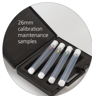
26mm calibration maintenance samples

Reusable non-glass accessories are available which are not only safe but allow easy preparation of a variety of samples, especially monofilaments and fabrics. Industry leading large volume tubes are available for more representative samples with the Advanced Package.